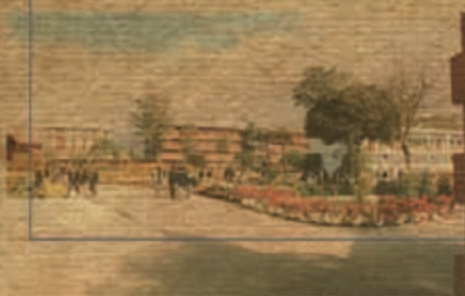
The Institute - 1