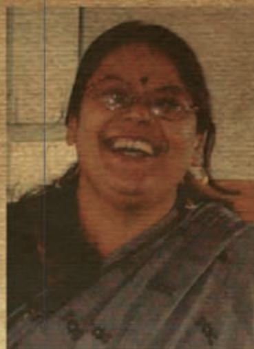
Mentors - 8